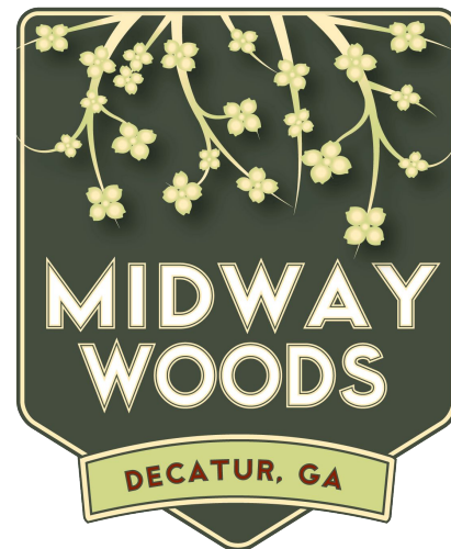
Midway Woods house flag

If you'd like a full run-down of the association's 2020 financials, email us at treasurer@midwaywoodsassociation.org and we'll get that information to you.